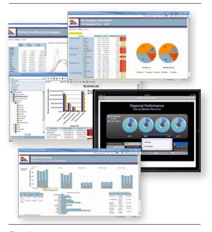
Figure 3: An intuitive, easy-to-use interface provides complete, self-service access to reports and analysis. Users can even receive business insights on their Apple iPad devices with a free application available from the Apple App Store.