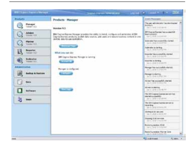
Figure 5: A web-based console manages all administrative aspects of installation, deployment and maintenance.

This shared foundation enables you to add new Cognos Express capabilities with "plug-and-play" ease.