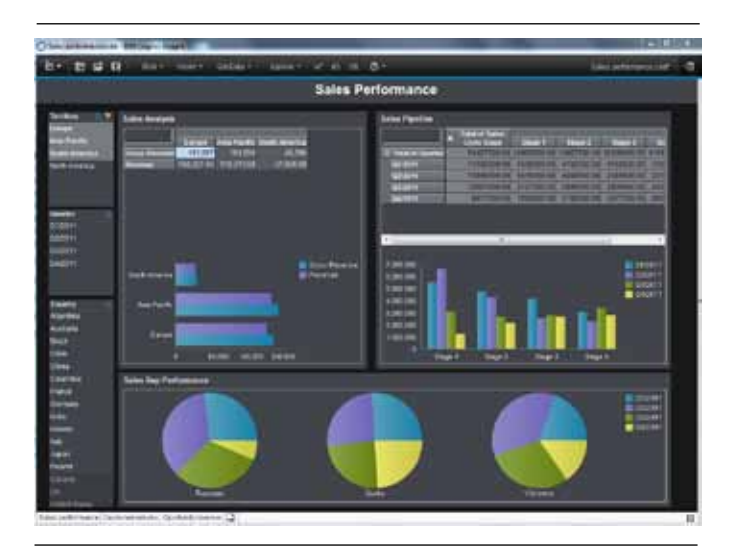
Figure 2: Interactive dashboards can include elements from any Cognos Express module and be easily shared company wide. Users can also move seamlessly from assembly to self-service authoring and deeper analysis.

With Cognos Express, data is presented in a business context that business users understand while ensuring data accuracy and consistency throughout the organization. This allows executives and managers in different departments to spend more time analyzing data and less time arguing over what data is correct. Write-back capabilities allow these insights to be turned into specific plans and actions for better business outcomes—for example, to align the right resources to capitalize on new opportunities.